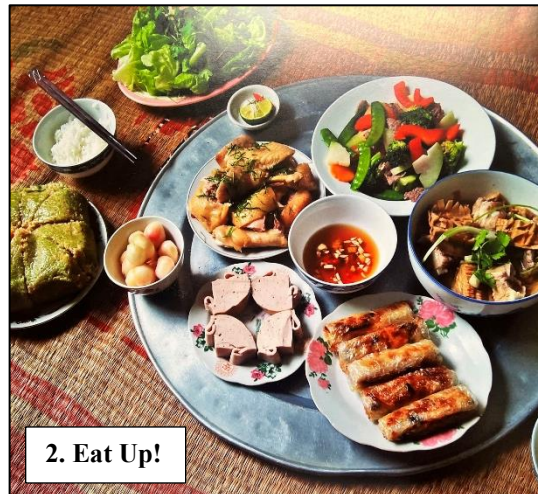
2. Eat Up!