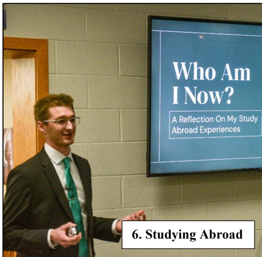
6. Studying Abroad