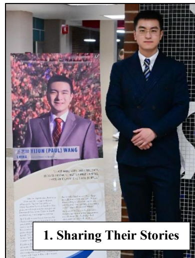
1. Sharing Their Stories