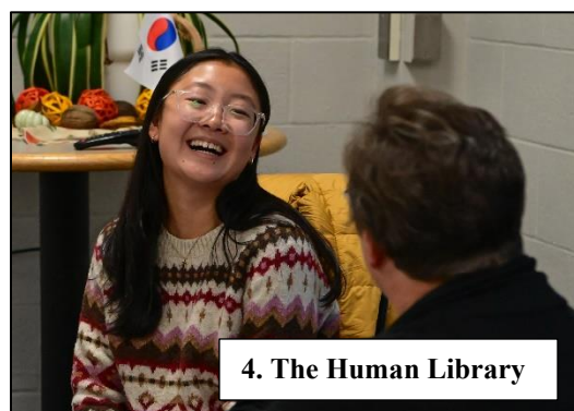
4. The Human Library