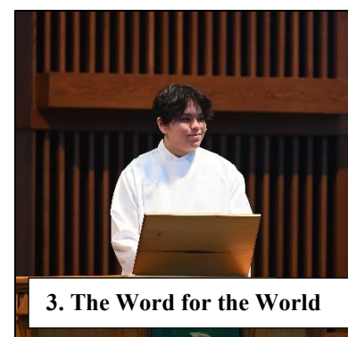
3. The Word for the World

It should be quite a sight! In heaven, we'll be part of a great multitude that includes "every nation, tribe, people, and language" (Rev. 7:9). At MLC, we're so grateful for that holy diversity—and unity—in Christ! During International Education Week we celebrate it!