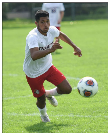
Santos in pursuit

The soccer teams are set to begin conference play this weekend with trips to Northland and UW-Superior.