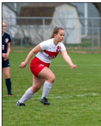
Bitter takes a penalty kick

The women's soccer team returned home to defeat Northland College 3-0 on Friday, April 23, for its first win of the season.