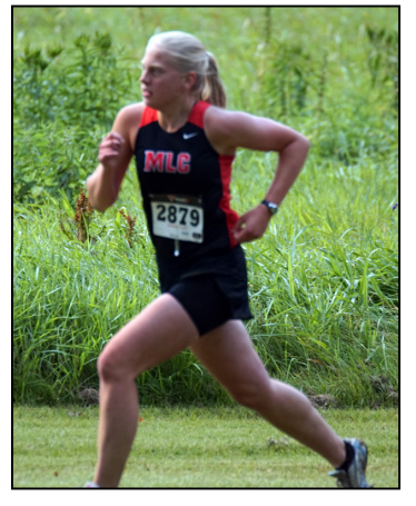
Punzel (LPS) keeps pace (2019)