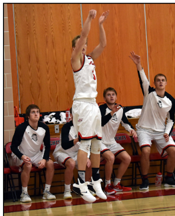
Kieselhorst from the corner

The men's and women's basketball teams opened practice earlier this month in preparation for what they hope will be a shortened 2020-21 season.