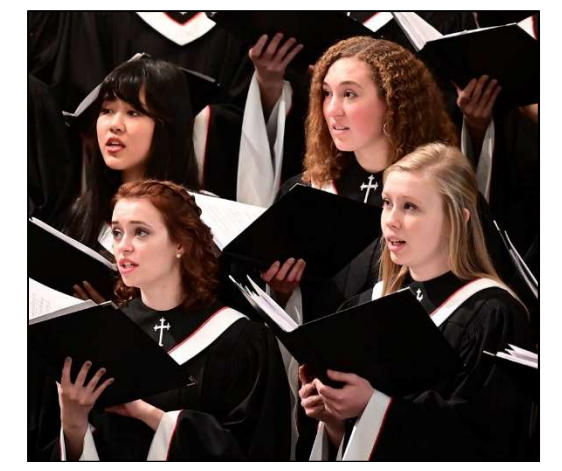
College Choir edifies morning worship at First Evan. in Racine for their 170th anniversary.