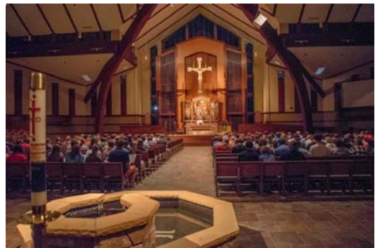
Compline is a meditative Monday night service.

Morning chapel is at 10:30. If you miss it, you can access it at any time from the archives.