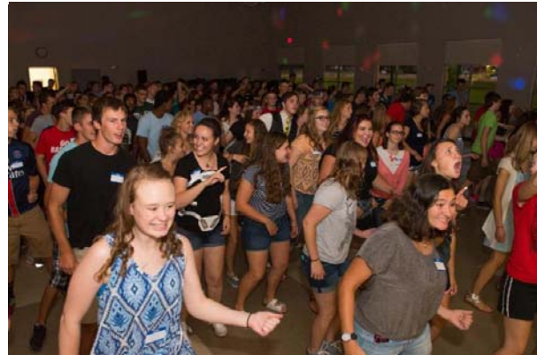
See your kids having a great time at the Ballroom Blast on our Photo Gallery.