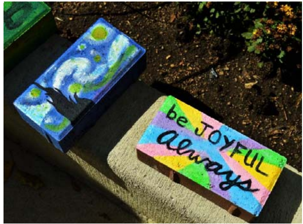
The women of Centennial Hall painted bricks as doorstops for their rooms. We see talent!

It's an emotional weekend, and since we're human, we respond in human ways - happy, sad, worried, giddy, shy. Rest assured: it all makes for a perfectly normal goodbye.