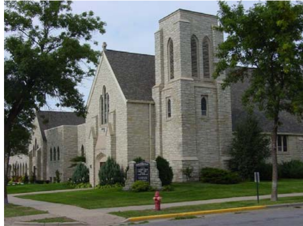
St . John Lutheran Church

Some MLC students jump right into congregational life at St. Paul and St. John : teaching Sunday school, helping with youth group, singing in the choir, adding instrumental music, and (for older preseminary students) doing liturgy. Other students simply go to church there, and that's fine too.