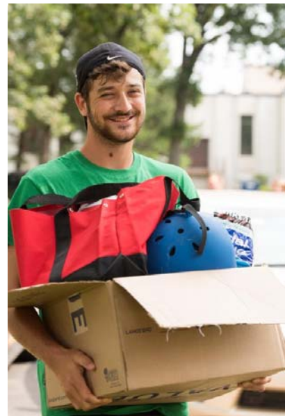
We hope our dorm staff served you well!