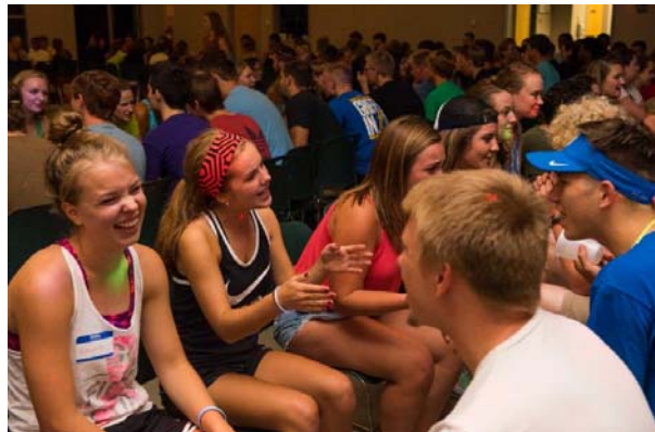
Your first-years getting to know each other at the Ballroom Blast

We hope this newsletter will serve you as well!