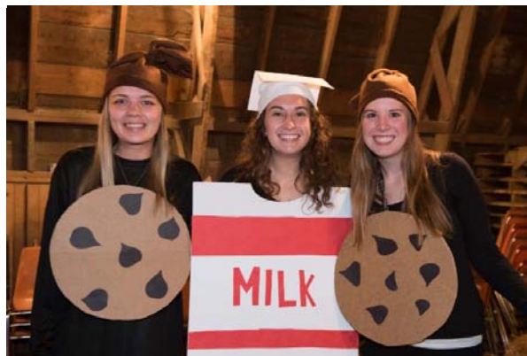
Students dress up at the Anchor Hoedown costume party and fundraiser.

Pictures from The Sound of Music , all athletics, Focus on Ministry, College Choir and Wind Symphony concerts, Homecoming, Ladies' Auxiliary, Anchor Harvest Hoedown, and much more!