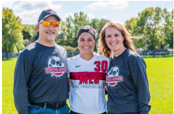
Soccer Parents' Day

The MLC Photo Gallery is updated regularly. Check out Homecoming and Parents' Day photos like this one, and much more.