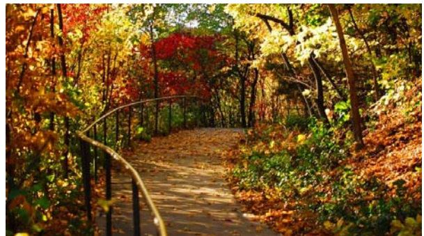
Fall colors are always beautiful along the Excelsior steps.

Academic anxiety: They may wonder: Is this what college is really like? Can I handle this course work? Am I using my time well? Do the professors like me? What are college exams like?