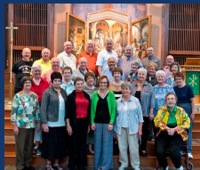
DMLC Class of '64

Contact the alumni office for information and assistance.