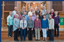
DMLHS Class of '64

Classes ending in 5 or 0, now is the time to start planning your reunions for 2015. Contact the alumni office for information and assistance.