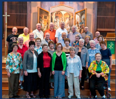
DMLC Class of '64

Classes ending in 5 or 0, now is the time to start planning your reunions for 2015. Contact the alumni office for information and assistance.