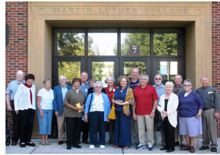
DMLHS Class of 1956

For further information on these gatherings or to plan one for your class, please contact the alumni office at (507) 217-1731.