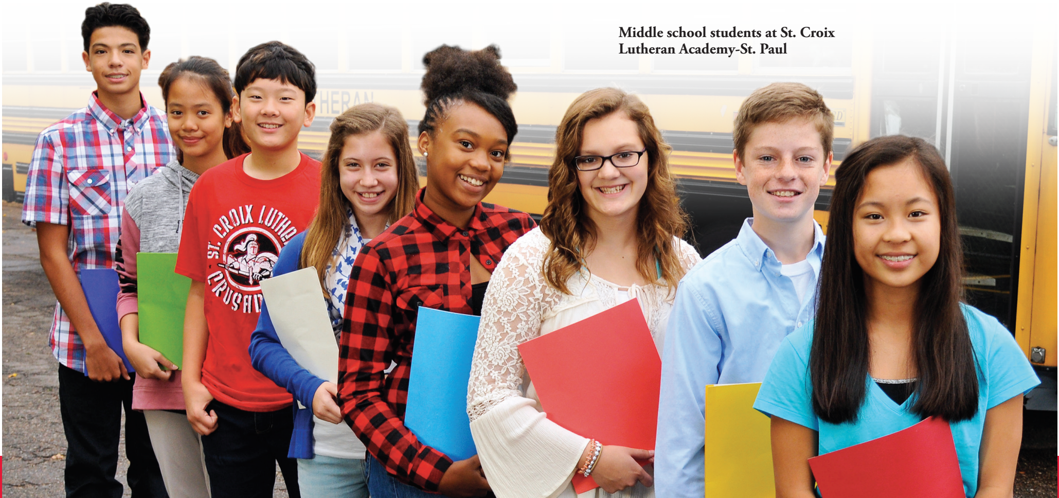
Middle school students at St. Croix Lutheran Academy-St. Paul

There is no more critical need in urban gospel ministry than raising up qualified Christian teachers from among the people of color connected with our schools. The development of an online competency-based degree program by our WELS College of Ministry is truly a godsend.