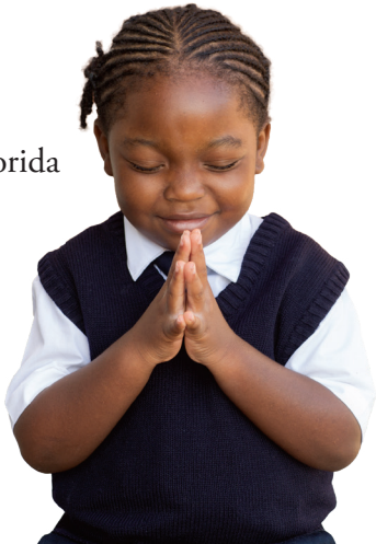
St. Marcus-Milwaukee student