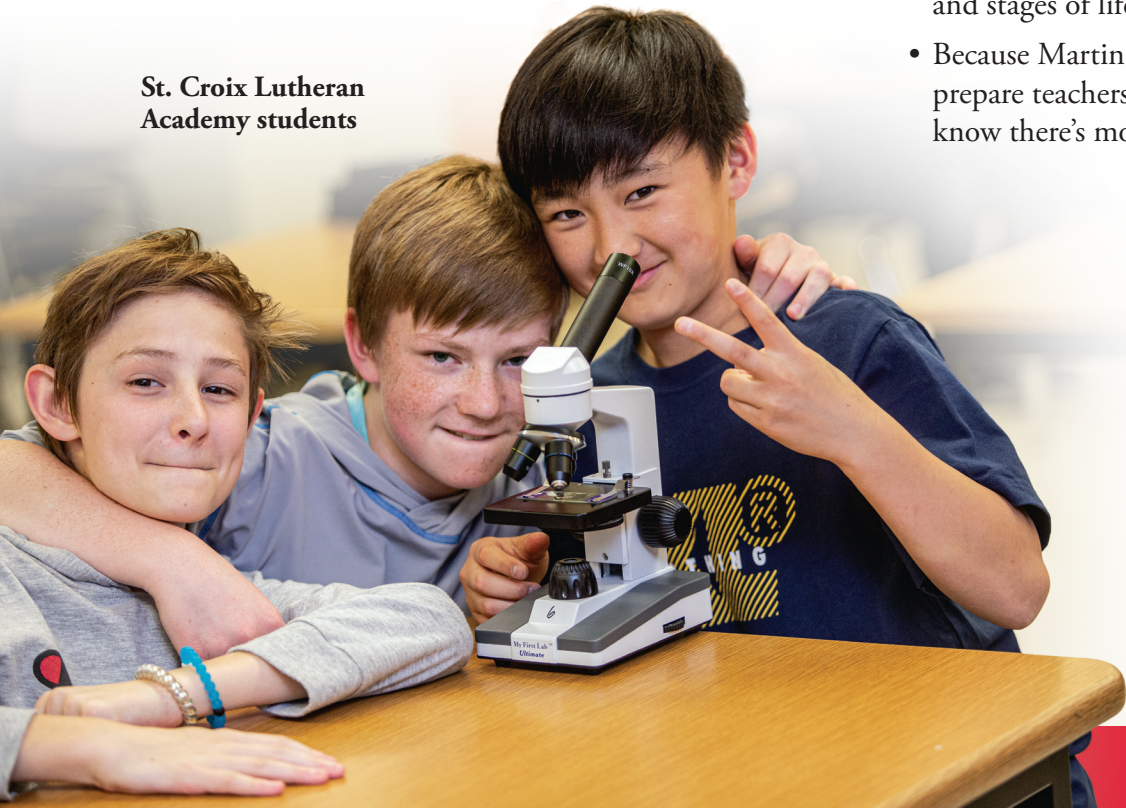
St. Croix Lutheran Academy students

Yes! I'd like to help launch this innovative program and get more WELS teachers into our classrooms!