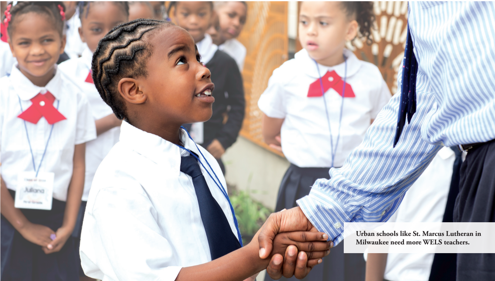
Urban schools like St. Marcus Lutheran in Milwaukee need more WELS teachers.

The need is real. WELS classrooms need more teachers. God has blessed our Lutheran schools, especially our urban schools, with incredible growth. But Martin Luther College's traditional program simply cannot supply all the teachers our schools need. Our enrollment is not large enough.