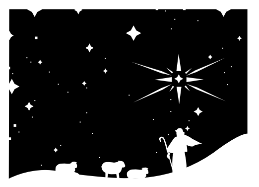
"And there were in the same country shepherds abiding in the field..."