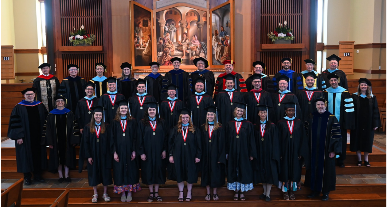
2024 graduates and graduate faculty