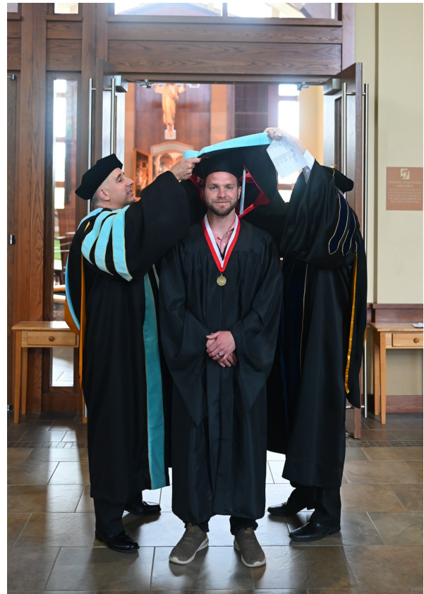
2024 hooding ceremony