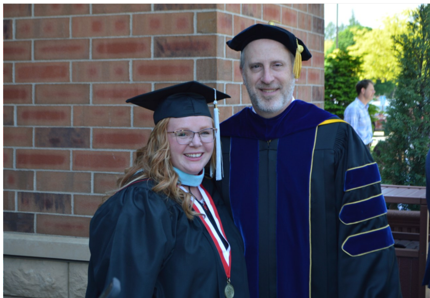
2024 director congratulating graduate