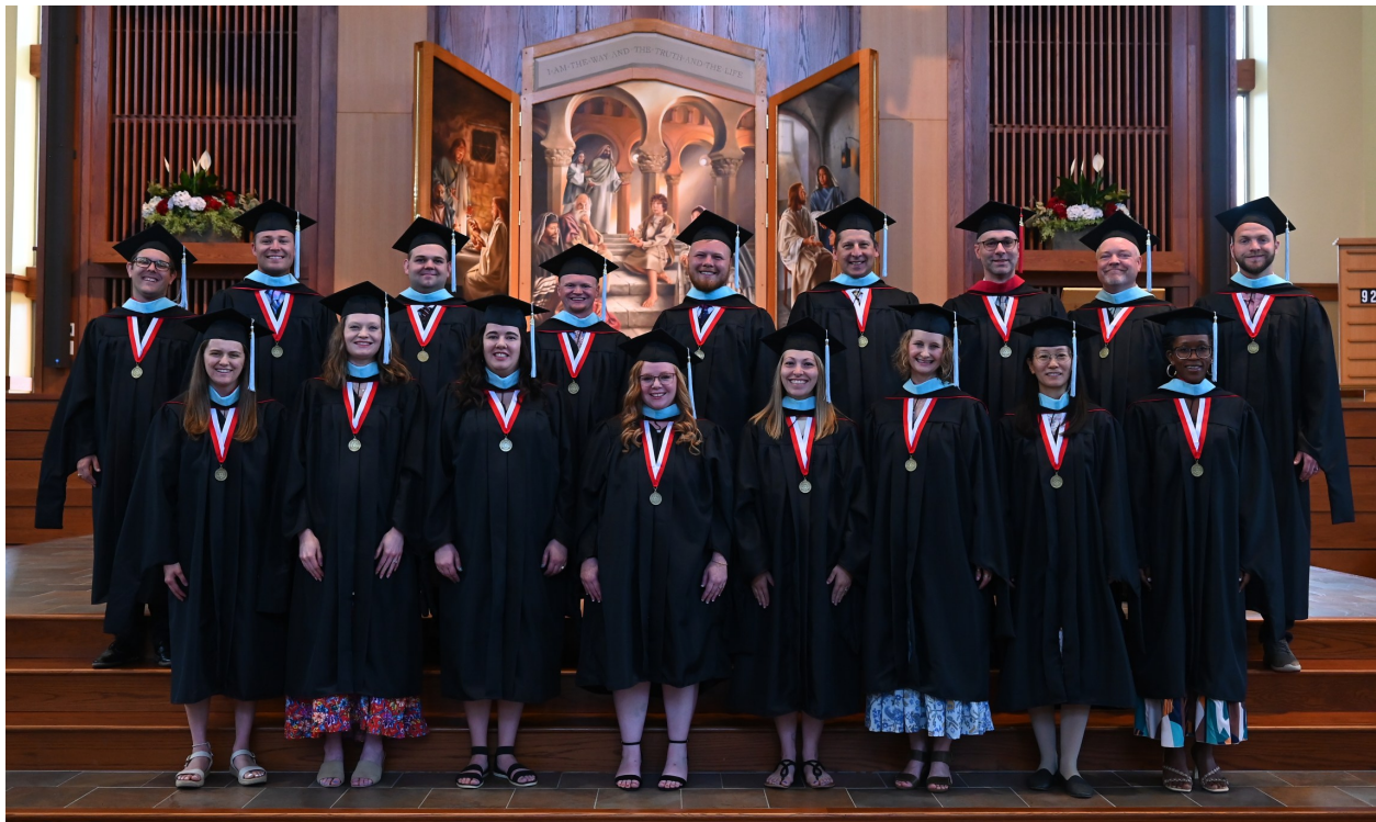
2024 Martin Luther College master's program graduates

In other words, professional growth as a reflective Christian educator and an educational leader is readily accessible through a trusted ministry partner, Martin Luther College.