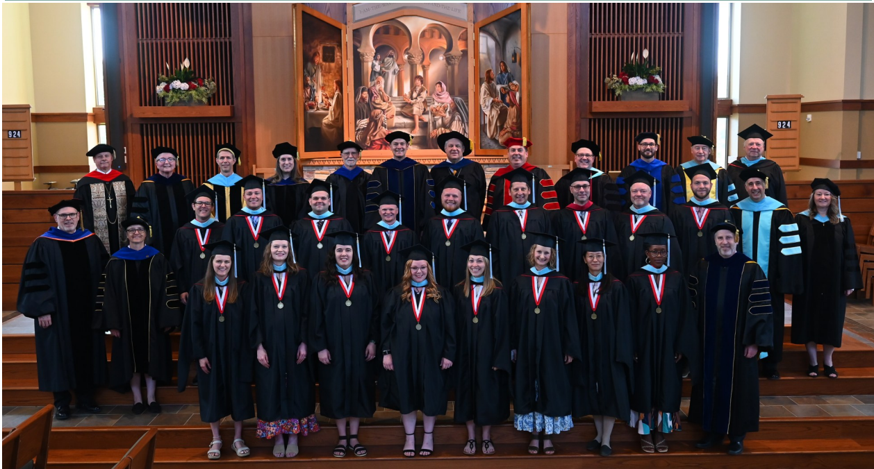
2024 graduates and graduate faculty