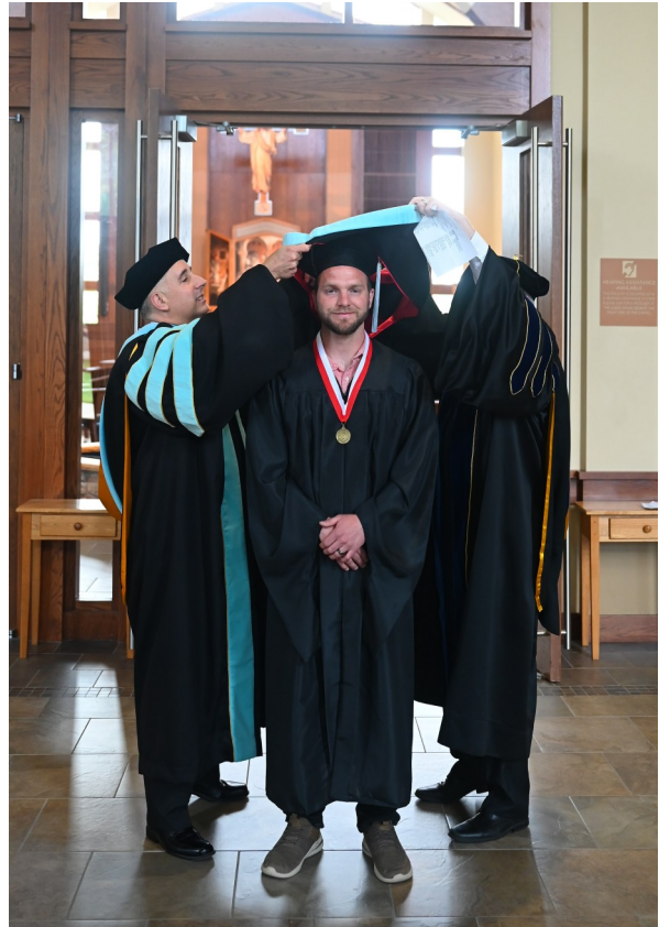
2024 hooding ceremony