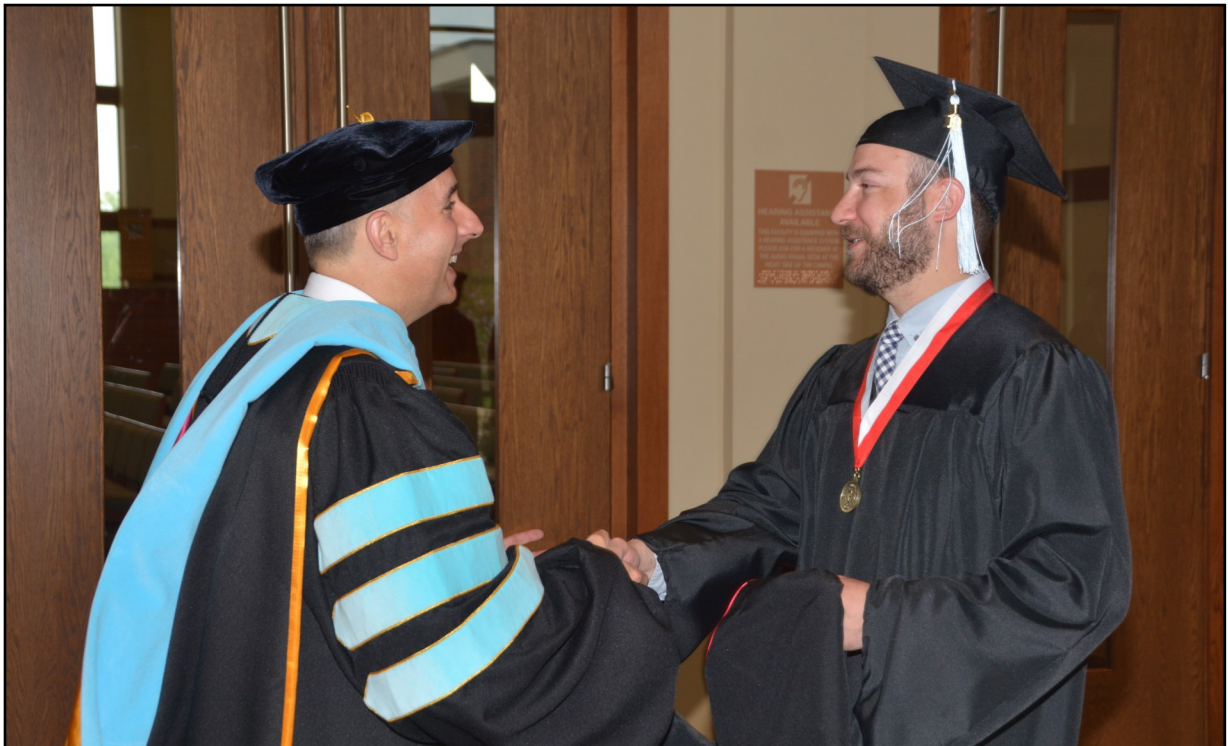
2019 advisor congratulating advisee