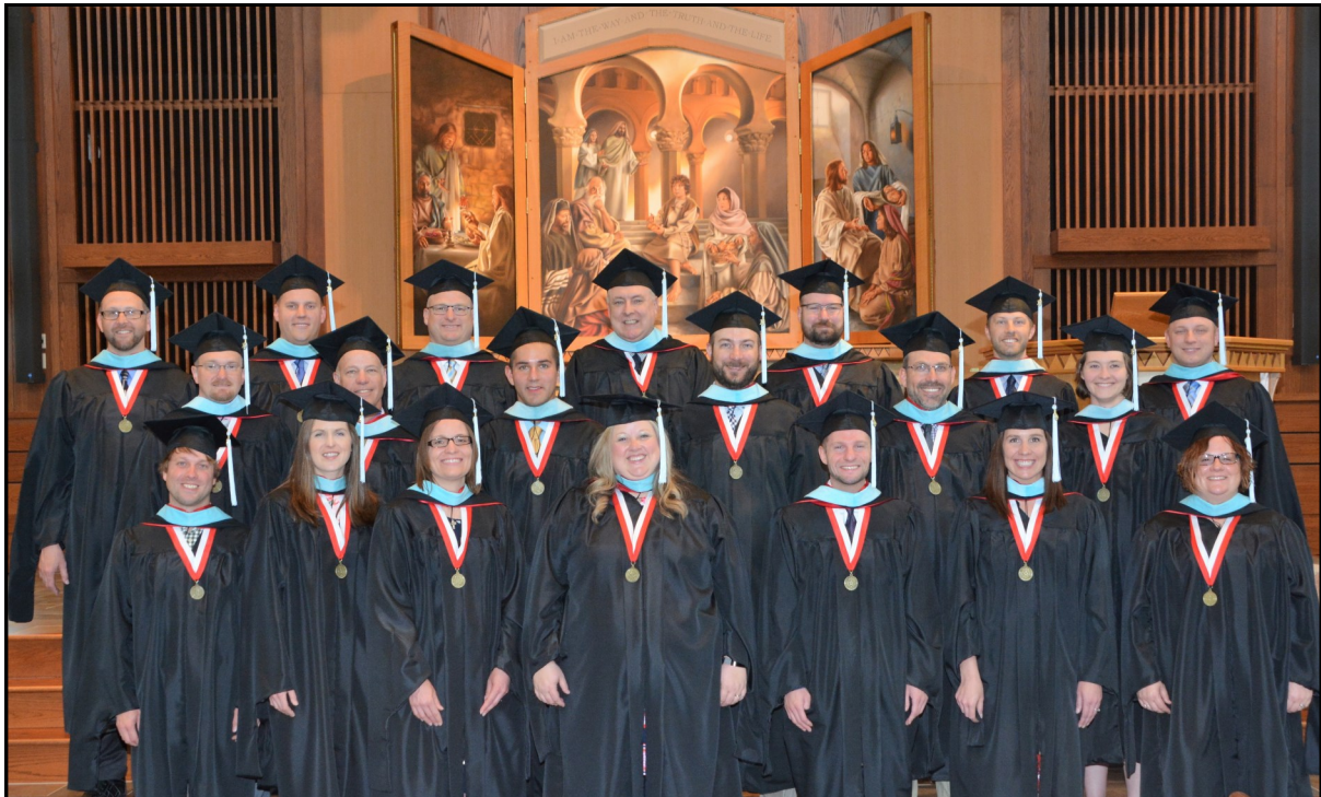
2019 Martin Luther College master's program graduates

In other words, professional growth as a reflective Christian educator and an educational leader is readily accessible through a trusted ministry partner, Martin Luther College.