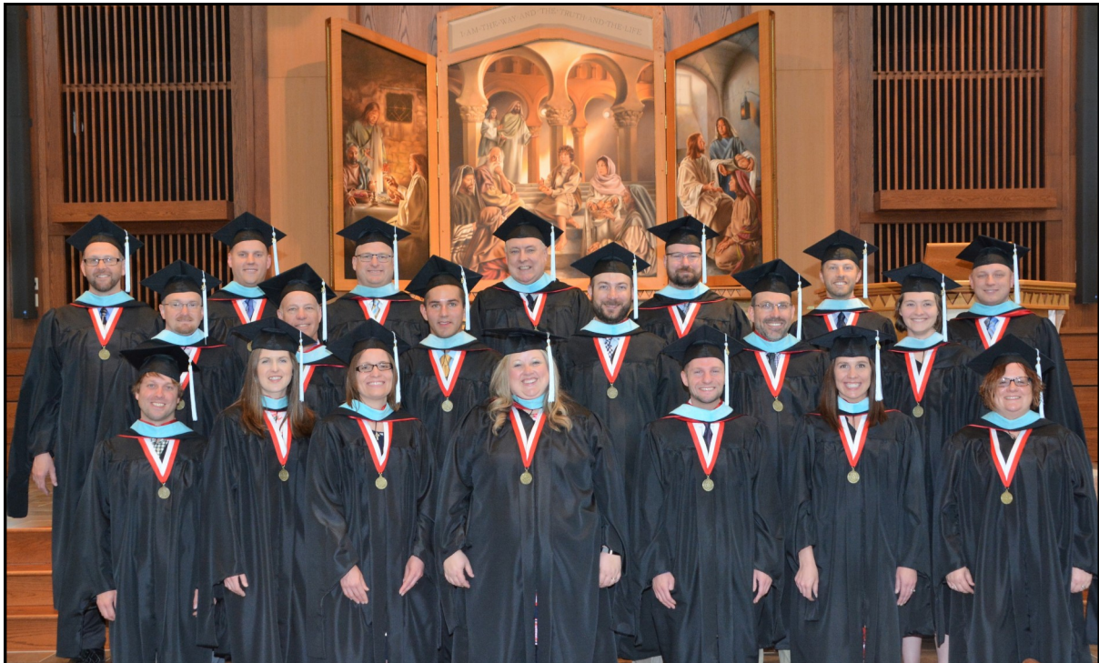
2019 Martin Luther College master's program graduates

In other words, professional growth as a reflective Christian educator and an educational leader is readily accessible through a trusted ministry partner, Martin Luther College.