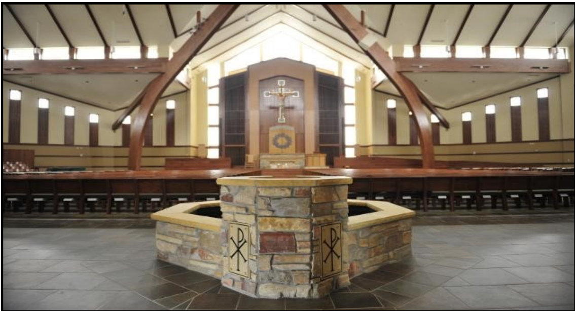
The Chapel of the Christ