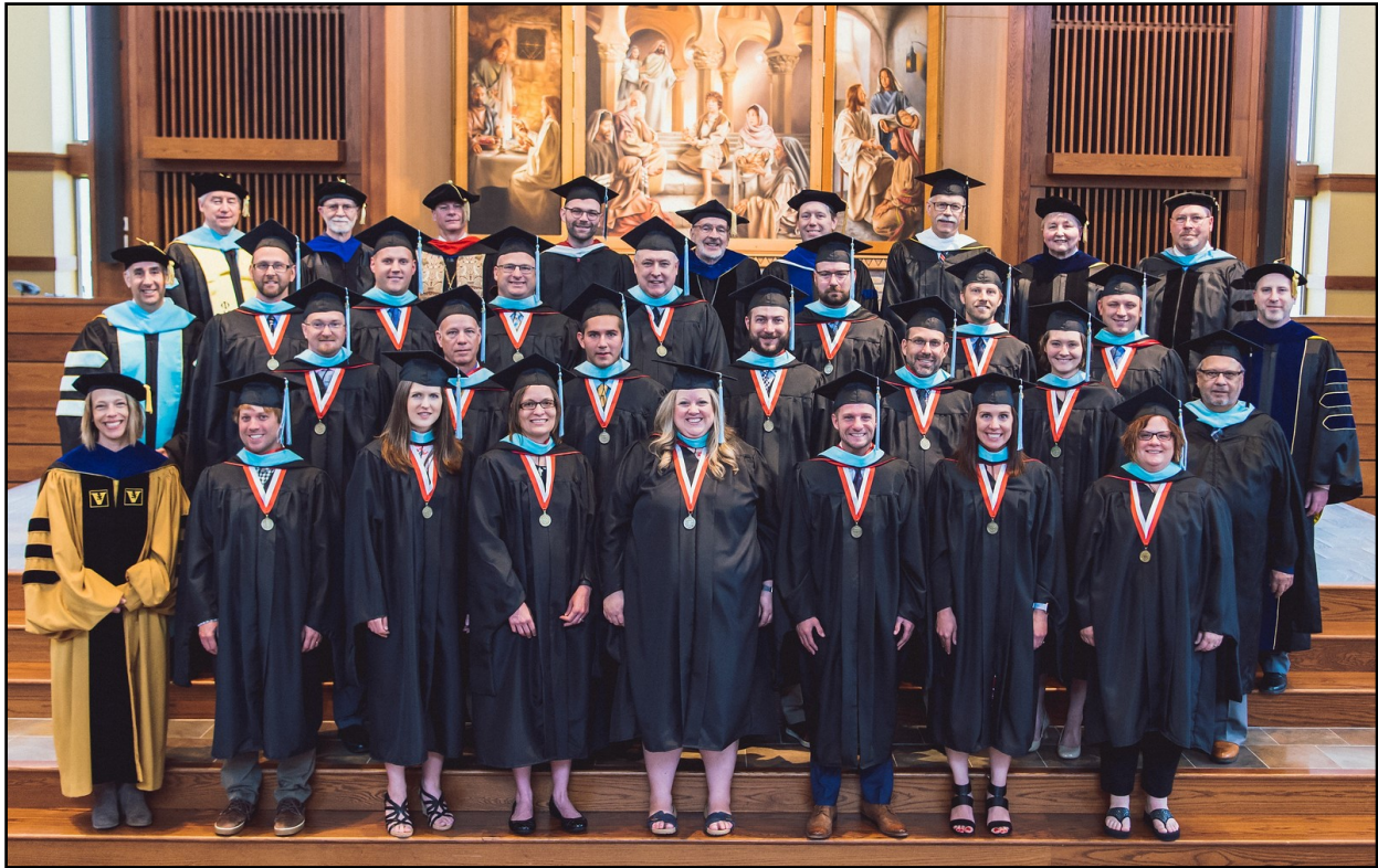
2019 graduates and graduate faculty