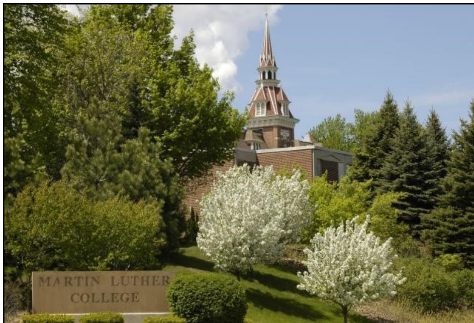
Old Main from Summit Avenue entrance