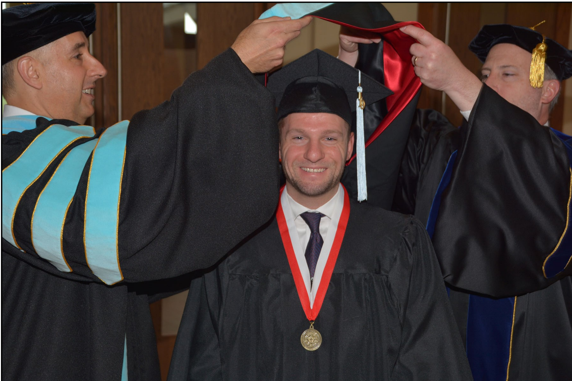
2019 hooding ceremony