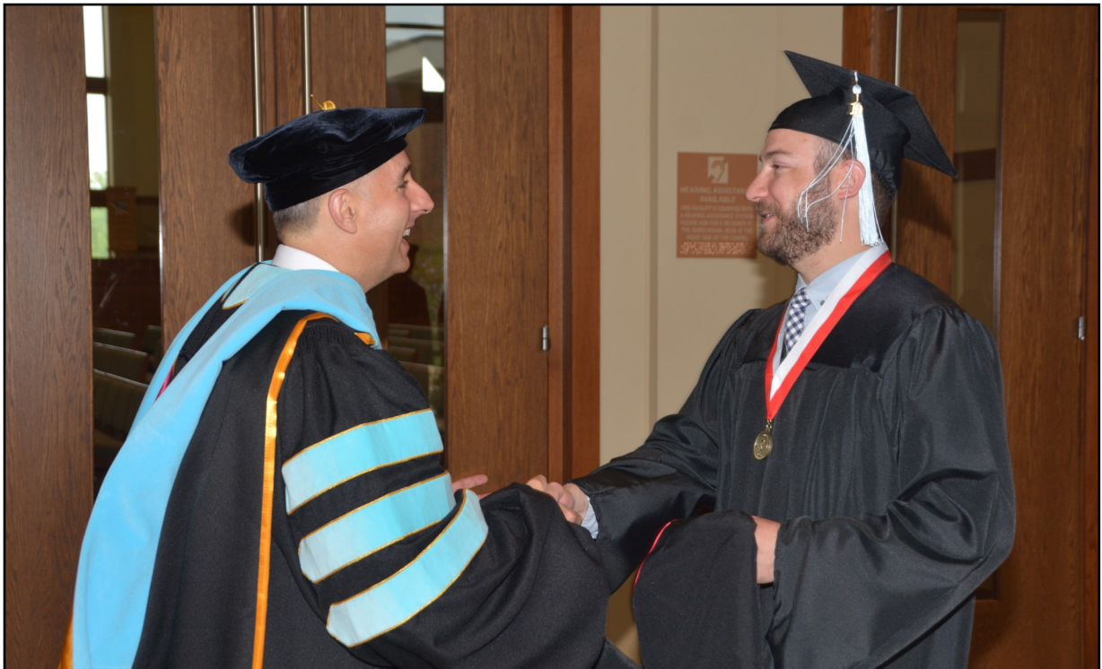
2019 advisor congratulating advisee