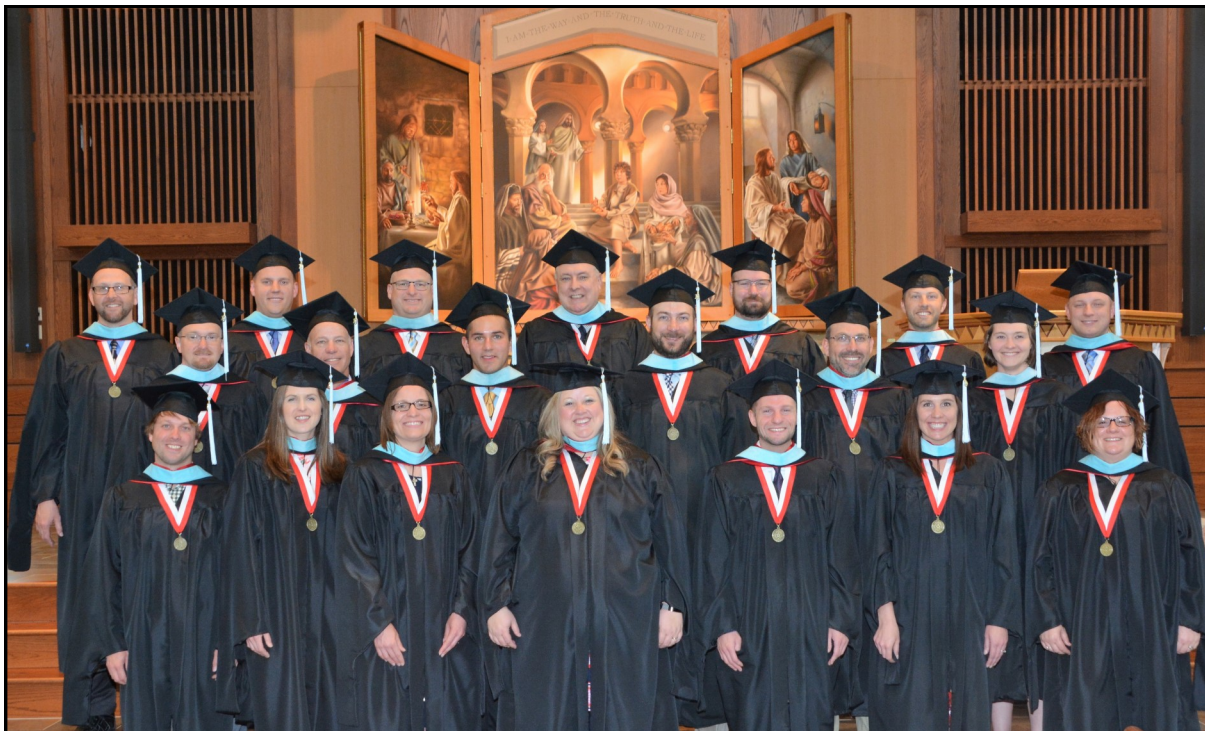
2019 Martin Luther College master's program graduates

In other words, professional growth as a reflective Christian educator and an educational leader is readily accessible through a trusted ministry partner, Martin Luther College.