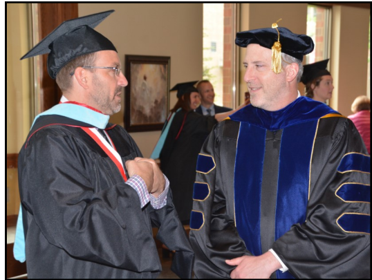
2019 visiting before graduation