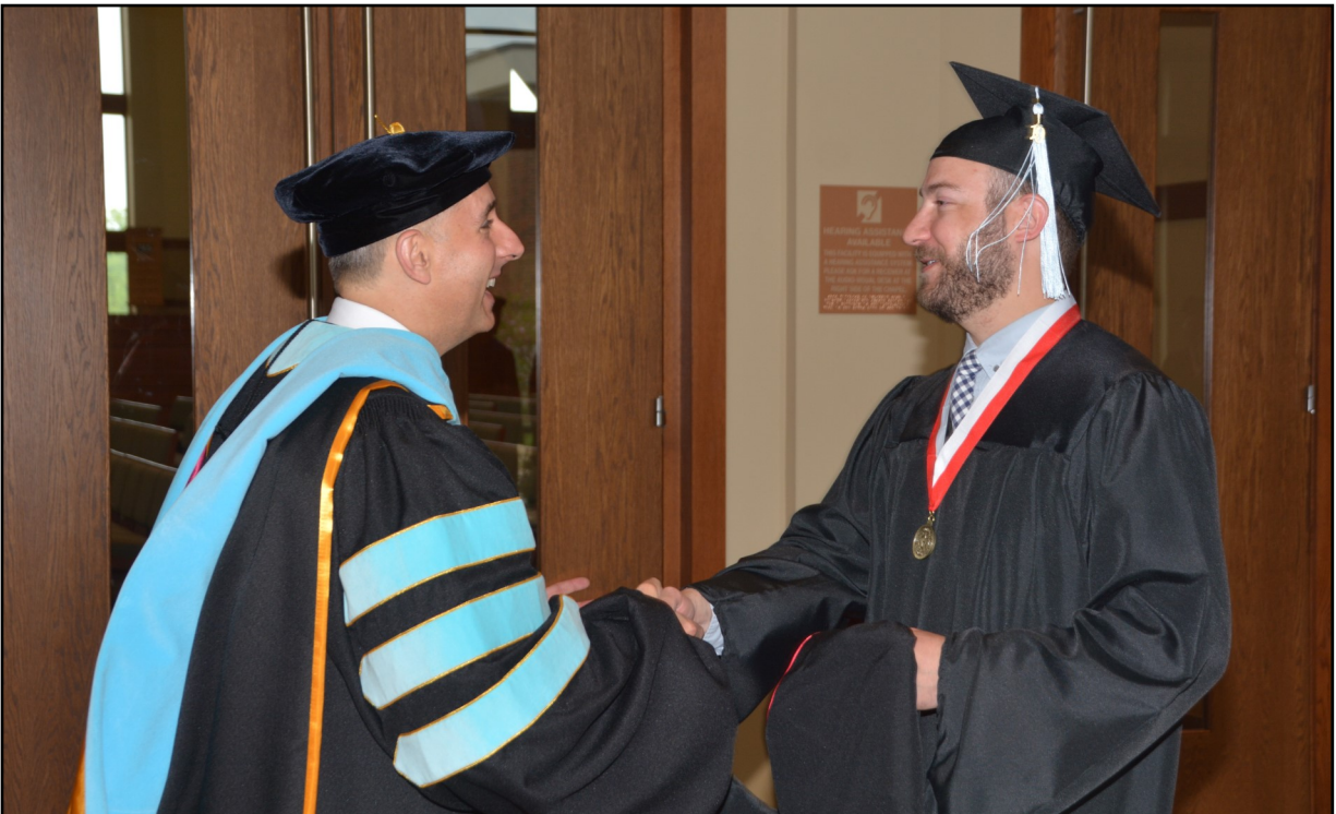
2019 advisor congratulating advisee