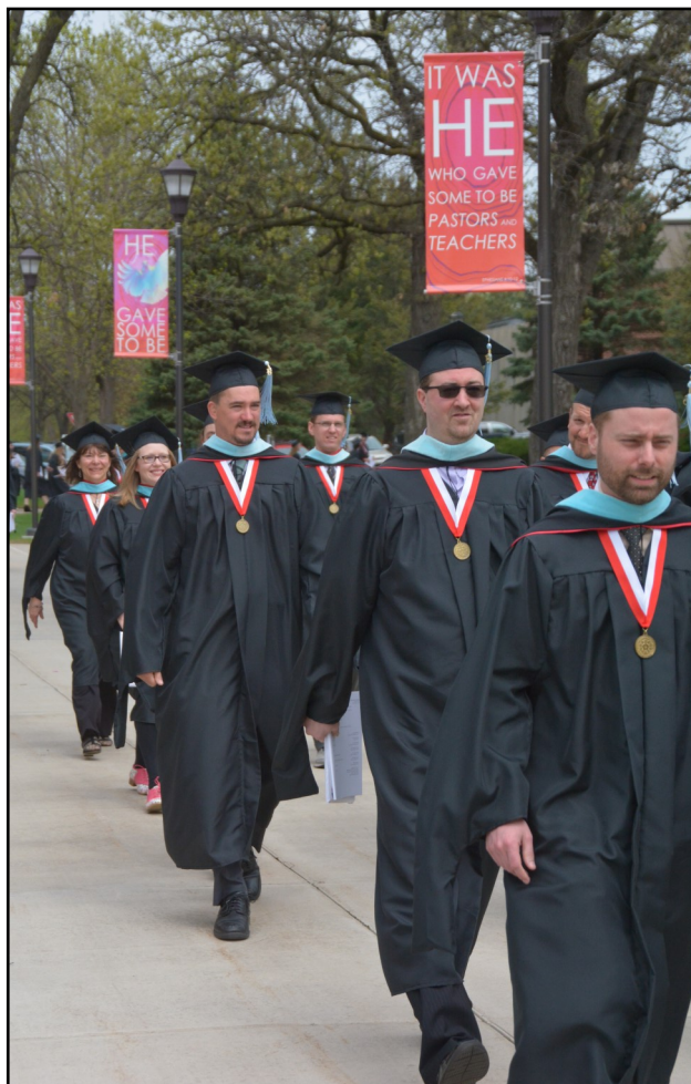
2018 graduation recessional