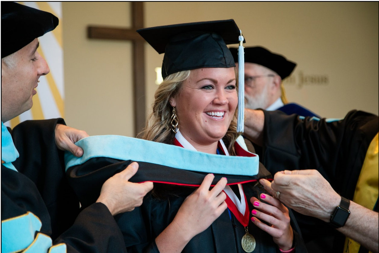
2018 hooding ceremony