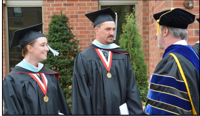
2018 receiving line for graduates