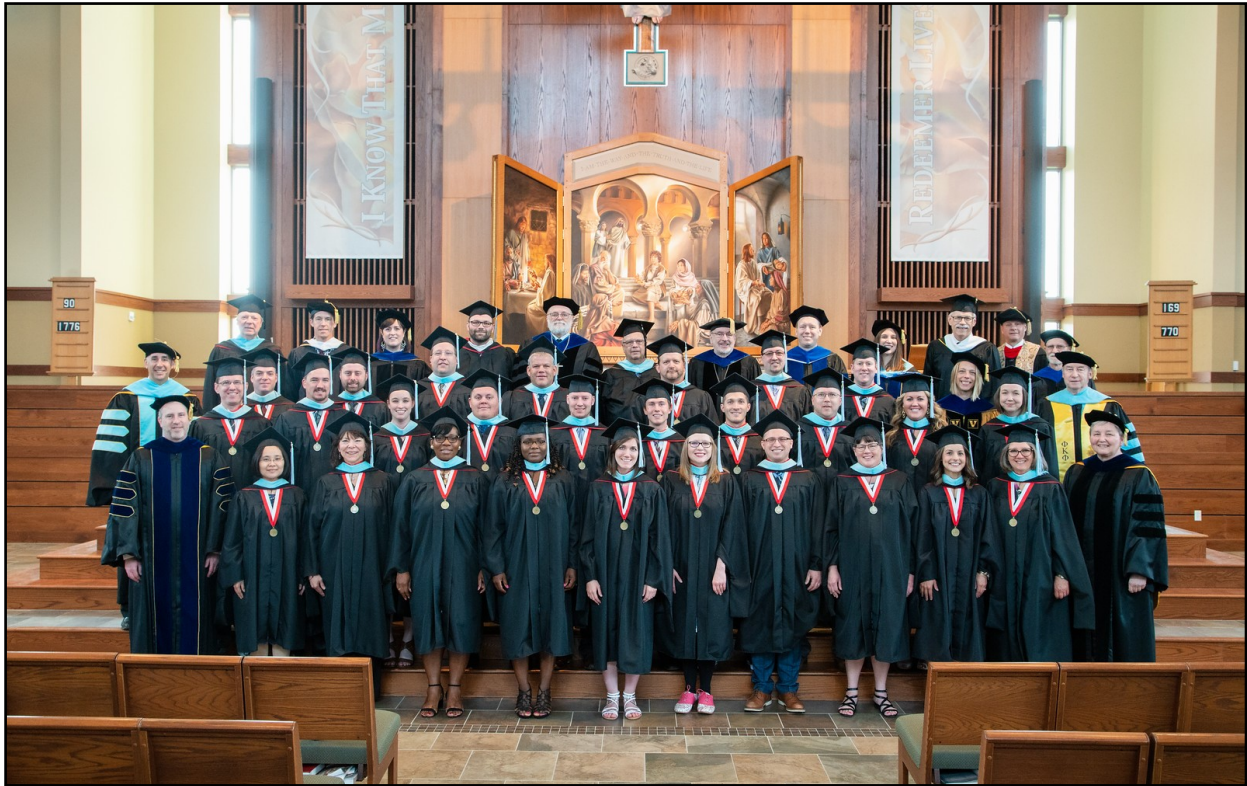
2018 graduates and graduate faculty