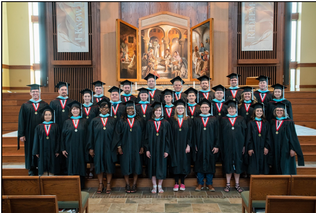
2018 Martin Luther College master's program graduates

In other words, professional growth as a reflective Christian educator and an educational leader is readily accessible through a trusted ministry partner, Martin Luther College.