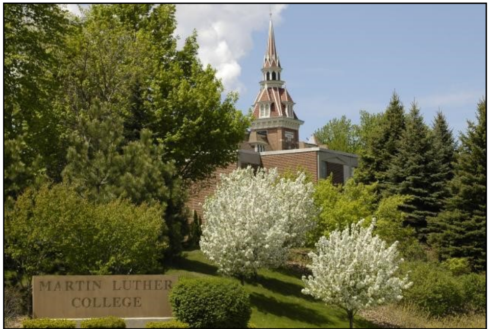
Old Main from Summit Avenue entrance