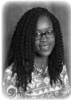
Tassia-Channel Clement Corinthe Estate, Gros Islet St. Lucia