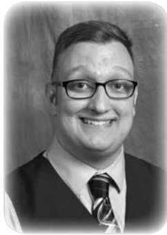
Vincent G. West-Hallwas Beach Park, IL