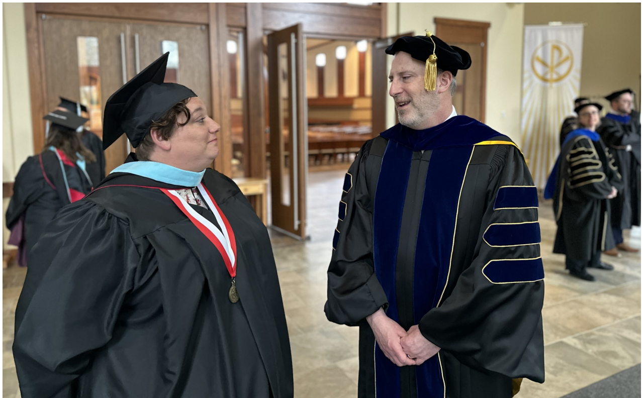
2023 director congratulating graduate