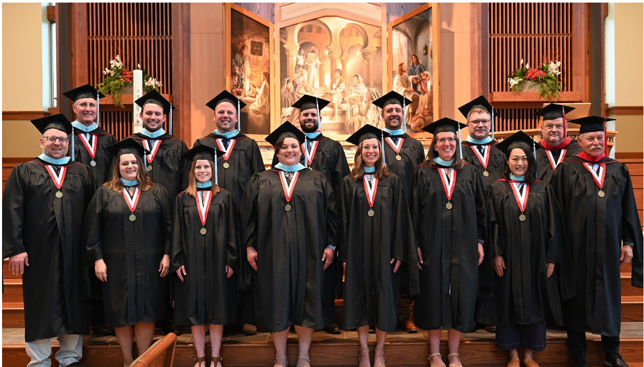
2023 Martin Luther College master's program graduates

In other words, professional growth as a reflective Christian educator and an educational leader is readily accessible through a trusted ministry partner, Martin Luther College.