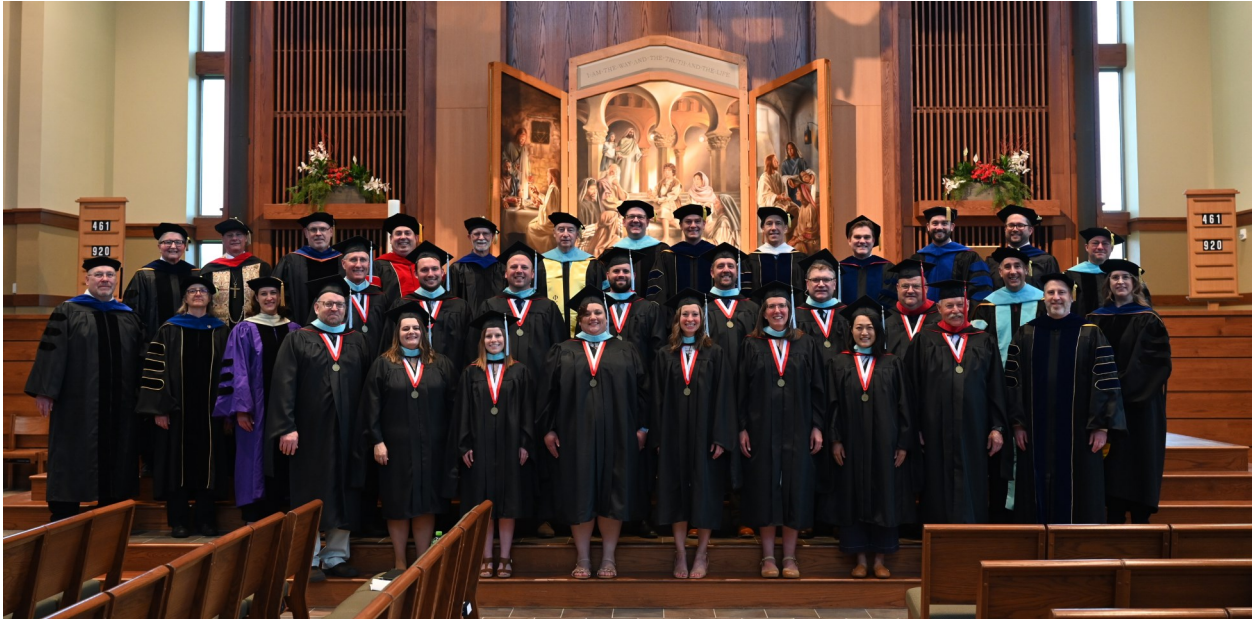
2023 graduates and graduate faculty