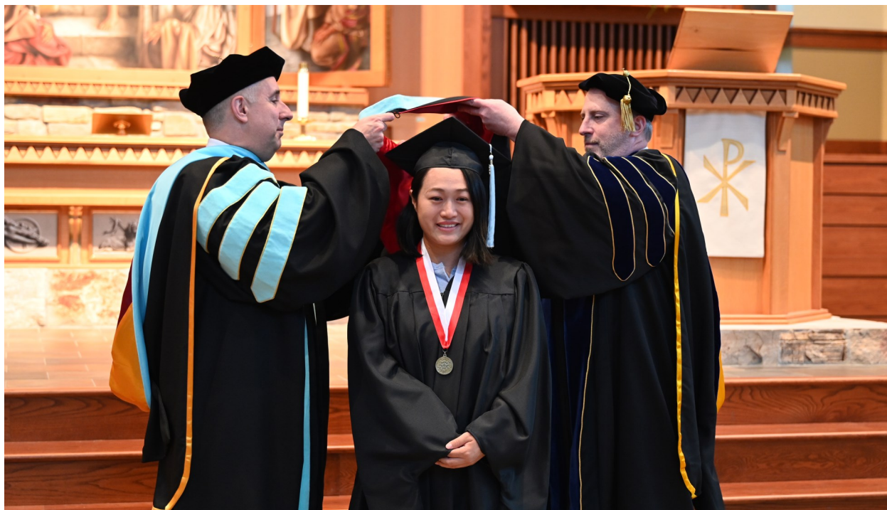
2023 hooding ceremony

A degree audit is done to ensure that the student has met all requirements to graduate. Students fulfilling all degree requirements graduate with either a Master of Science or a Master of Arts degree depending on the program in which they are enrolled. Graduating students participate in the May commencement exercise regardless of when they complete their degree requirements. Students wear appropriate academic regalia for the commencement exercise.