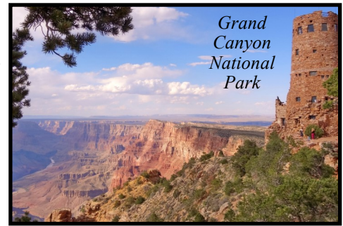
Grand Canyon National Park

nights at Lake Powell Resort in Page. Your lake view room will put you steps away from some incredible scenery. In addition to a boat tour of Lake Powell and Antelope Canyon , we'll stroll through a secret slot canyon, and have time for some fabulous photos at the renowned Horseshoe Bend .