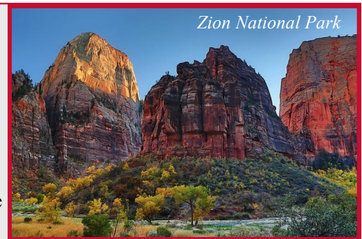
Zion National Park

Grand Staircase Escalante and on to Bryce, where we'll settle in at the Best Western Grand . Take some time to shop at Ruby's General Store , conveniently located across the street. The next morning we'll experience Bryce Canyon , beautifully arrayed in brightly colored windows, fins, and spires called hoodoos. From there we head to Springdale for two nights at the La Quinta Inn and Suites . Our Saturday in Zion will include views of iconic sites such as the Court of Patriarchs, the Temple of Sinawawa, and the Narrows. We'll conclude our time in Utah with Sunday morning worship at Redemption in nearby St. George.