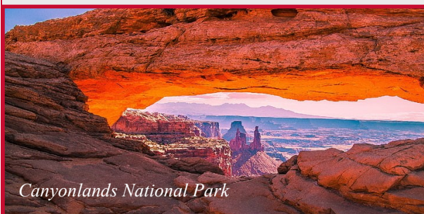
Canyonlands National Park

Our time in the Beehive State will center on visits to five fabulous national parks. Each features unique wonders that will lead us to marvel at God's might and majesty. Our first two nights will be at the Mainstay Suites in Moab, a central spot for visits to Arches (home to over 2000 of its namesake features) and Canyonlands . Its main street location will allow you to dine, shop, or just stroll the streets of this tourist town. From there, we'll work our way west to Capitol Reef (one of the most underappreciated and least-visited parks) and an overnight at the Capitol Reef Resort . Your room at this remote motel will face the park, with a private patio for viewing the stars or the sunrise. Spectacular Hwy 12 will take us through