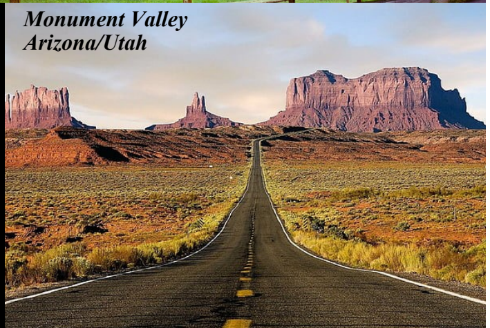
Monument Valley Arizona/Utah