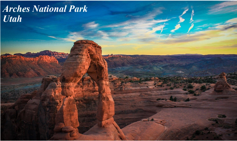
Arches National Park Utah