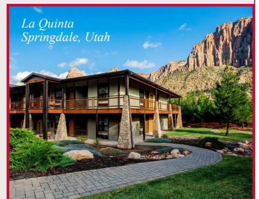
La Quinta Springdale, Utah

Our accommodations are all highly rated non-smoking 2-star or 3-star establishments with WiFi and breakfast included.