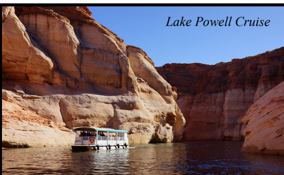
Lake Powell Cruise

Although there will be plenty of photo-op turnouts and short hikes to various vistas, many of the top sites will be visible from the comfort of our motor coach. This region contains some of the top scenic drives in America, including Hwy 163 through Monument Valley, Hwy 128 , Hwy 12 , and Hwy 9 through Utah, and Hwy 89A in Arizona. We'll drive them all, while hitting the highlights of each national park along the way.