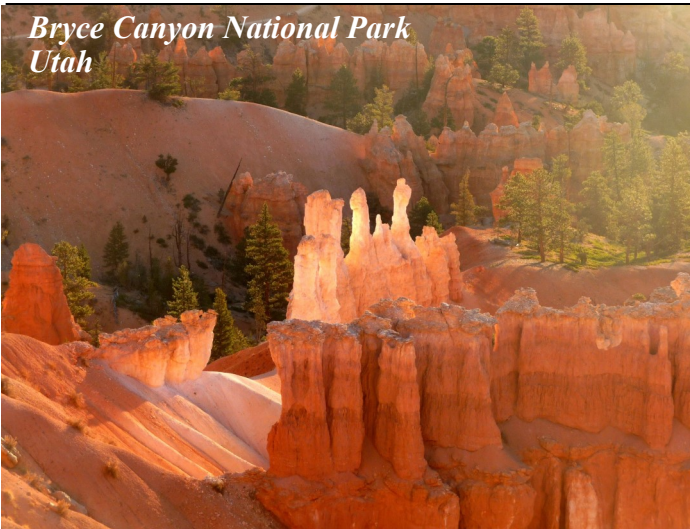
Bryce Canyon National Park Utah