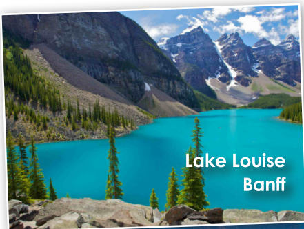
Lake Louise Banff

In Vancouver, we'll worship at Saviour of the Nations and take a guided tour with stops at Stanley Park and Granville Island. As we leave town, we'll visit North Vancouver's fabulous Capilano Park and Grouse Mountain before working our way up the Sea-to-Sky Highway for a quiet night and free morning at the Delta Suites in the heart of Whistler Village.