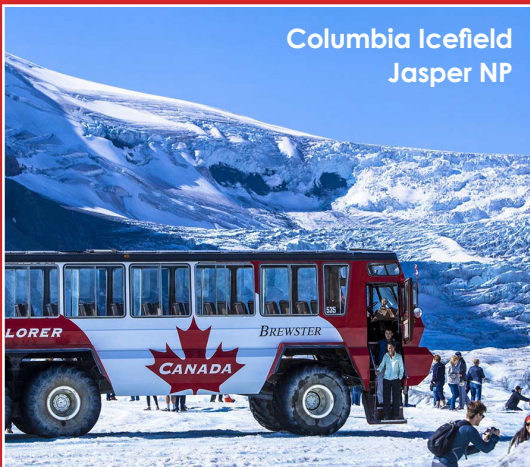
Columbia Icefield Jasper NP