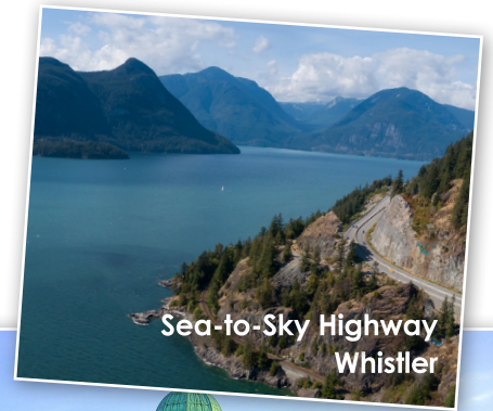
Sea-to-Sky Highway Whistler