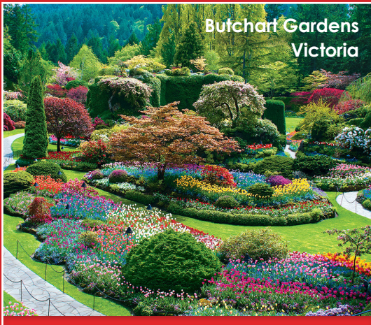
Butchart Gardens Victoria