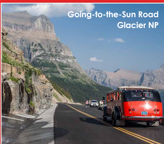
Going-to-the-Sun Road Glacier NP

Join MLC Alumni and fellow WELS members for a 16-day, 15-night guided tour