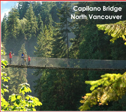
Capilano Bridge North Vancouver