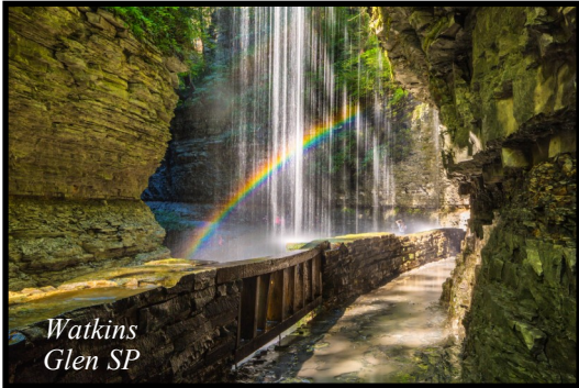
Watkins Glen SP

The Best Western Plus/Liverpool will be home base for our central New York visit. The region gets its name from 11 long, narrow, glacial lakes surrounded by rolling hills and some incredible state parks. Pack your cameras, as we'll enjoy many vistas of the lakes and visit several of those stunning state parks—including two that USA Today ranked among the top in the nation: