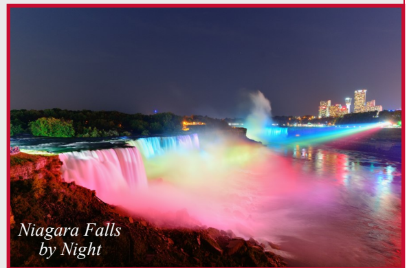
Niagara Falls by Night

get up close to the falls (both day and night). Our excursions will also take you off the beaten path with visits to Old Fort Niagara, the Whirlpool, and Niagara-on-the-Lake, Ontario.