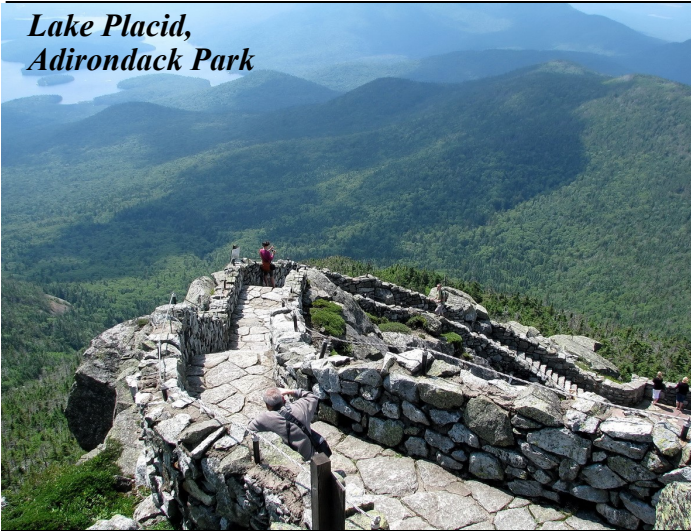
Lake Placid, Adirondack Park