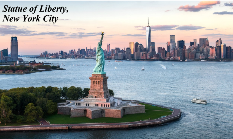
Statue of Liberty, New York City