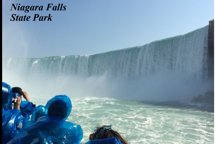
Niagara Falls State Park