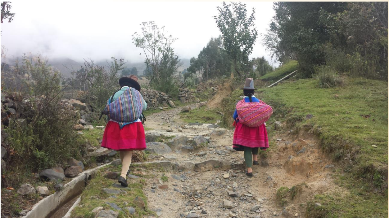
2015 Joe Schmudlach '15 Unordinary Guides: Peru